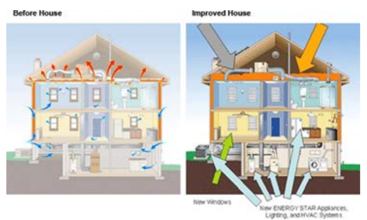
Figure 4: Energy Efficiency Measures Under the Clean Energy Upgrade Financing Program

Pursuant to Public Resources Code Section 26081, Table 10 provides a status of the