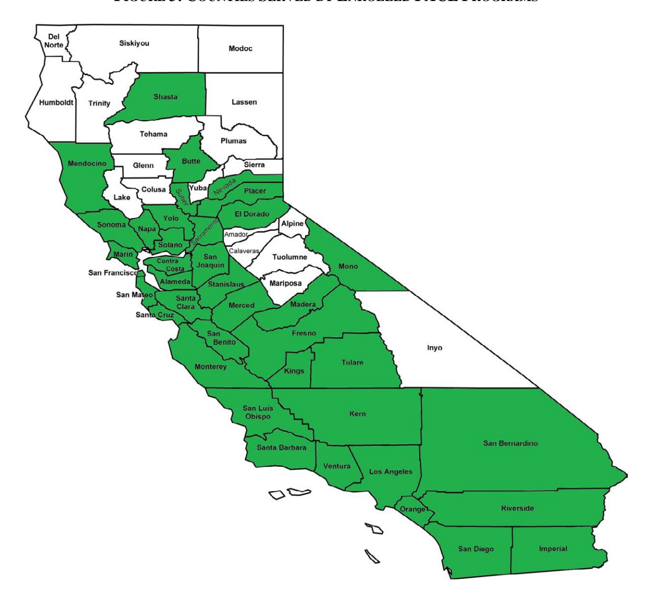
FIGURE 3: COUNTIES SERVED BY ENROLLED PACE PROGRAMS

A list of all communities currently served by enrolled PACE programs can be found in Appendix B.