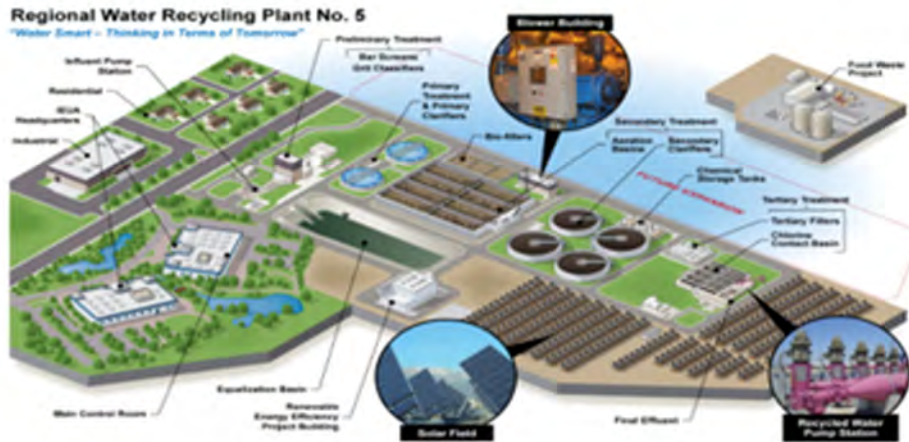
Figure 1: RP-5 Facilities