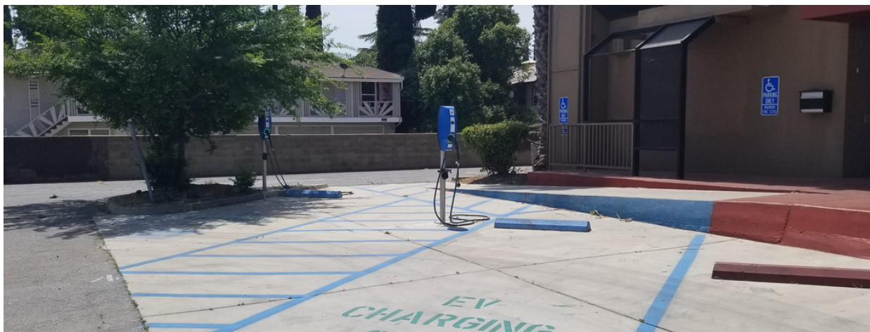
A Green Commuter EV charging installation at Fagbule Glass House Event Center in Fresno.

Such electric vehicle charging installations are integral to the state's goal of providing electric vehicle access for everyone, including the electric vehicle ride-sharing community.