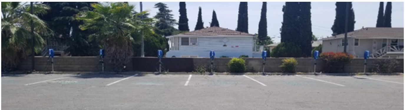
EV charging stations made possible by CalCAP's financing program. These are located near Fresno's Beneficial State Bank.