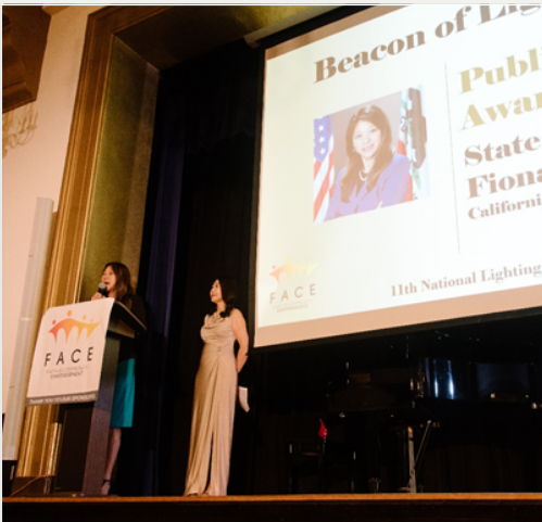
FACE 20th Anniversary Awards Gala