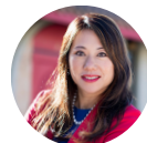
Fiona Ma, California State Treasurer