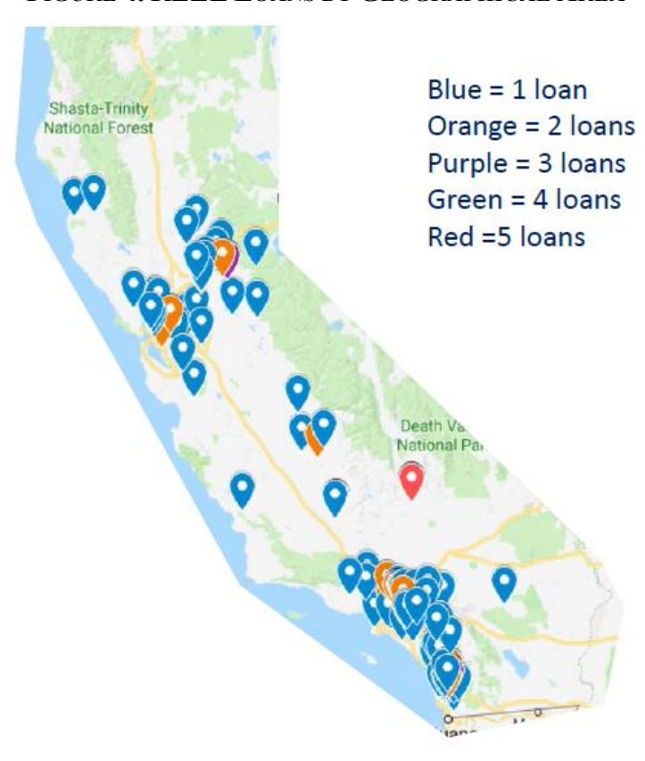
FIGURE 4. REEL LOANS BY GEOGRAPHICAL AREA

Participating lenders are lowering their interest rates, extending loan terms, and broadening access to financing for borrowers with lower credit scores. The table below provides an overview of participating lenders' terms of their REEL financing product in comparison to their standard unsecured financing product.