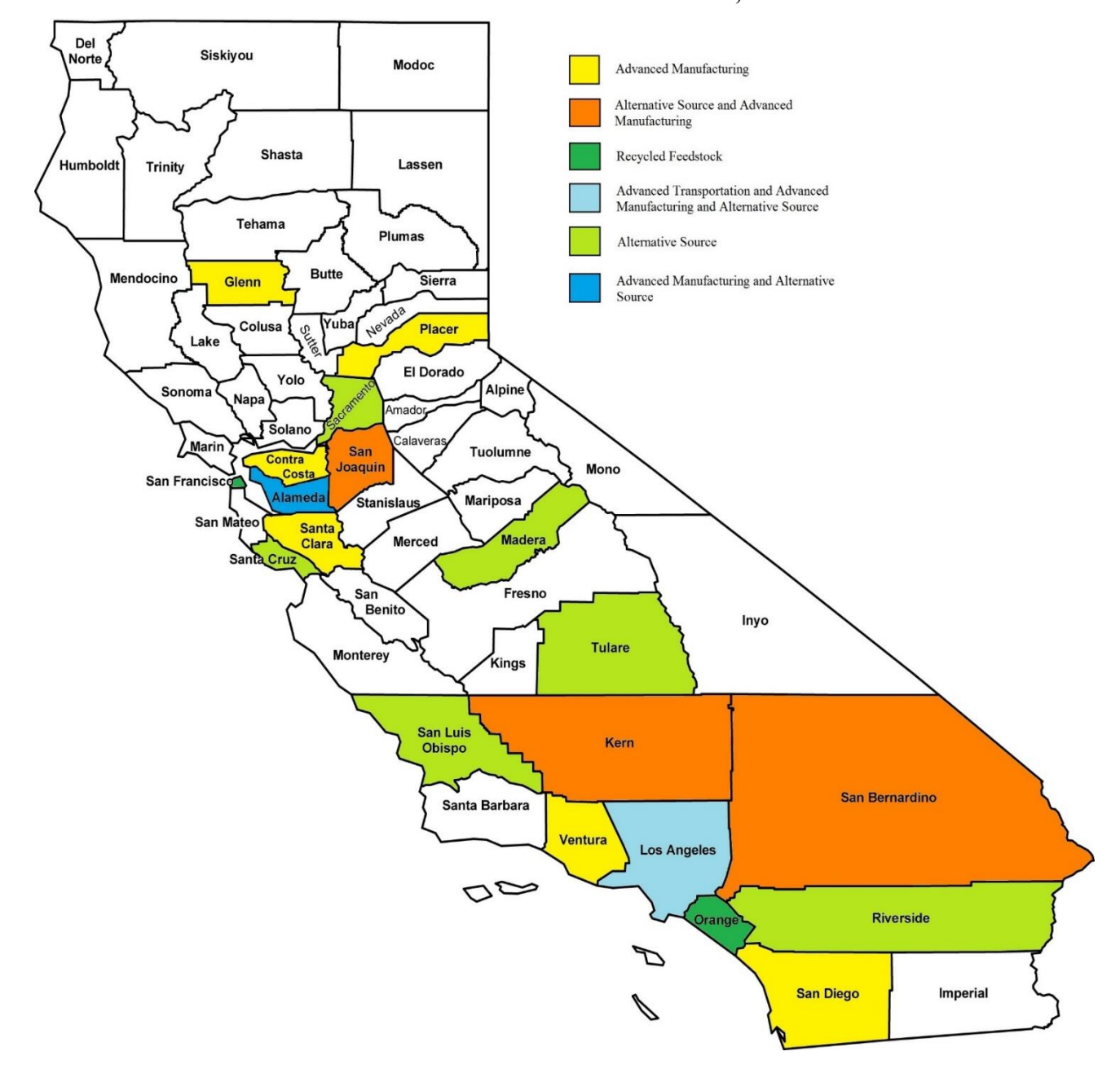
FIGURE 2. STE PROJECTS APPROVED IN 2017, BY COUNTY

Figure 2, below, shows a geographical representation of all projects approved under the STE Program in 2017.