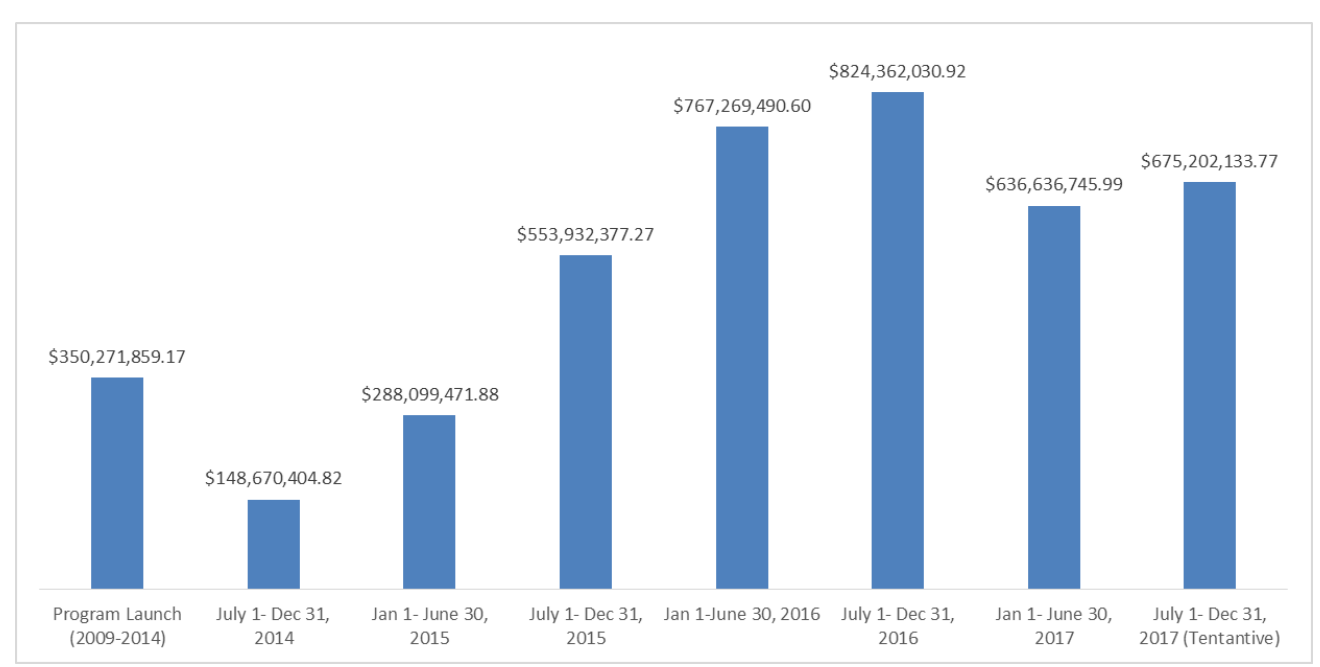
FIGURE 3. PACE ORIGINATION ACTIVITY

Since the Program's launch, residential PACE has seen a significant increase in origination activity, with residential PACE administrators offering PACE financing in most counties in California. Figure 3, below, shows the growth of the enrolled portfolio of PACE financings in the Loss Reserve.