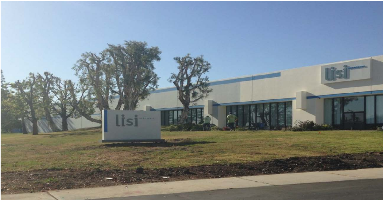
Figure 1: The Project facility located in the City of Industry.

The Project is anticipated to result in a sustainable manufacturing system that reduces energy consumption, water use, and hazardous waste. For example, the Project will completely eliminate the use of all solvents and will capture and recycle water, anticipated to result in a 12% reduction in water use.