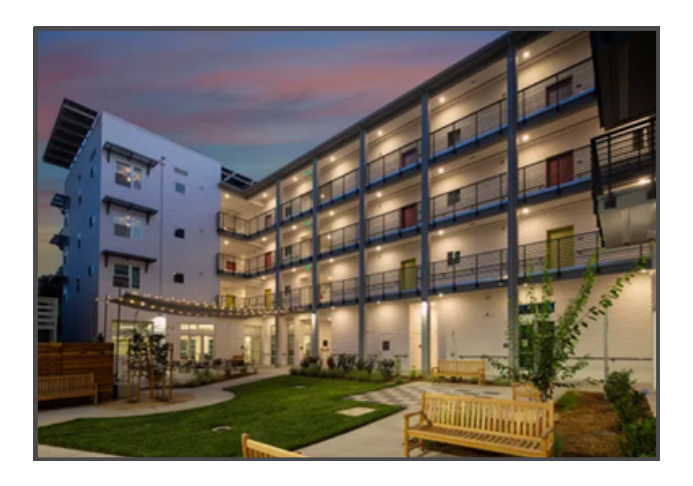
Lavender Courtyard.