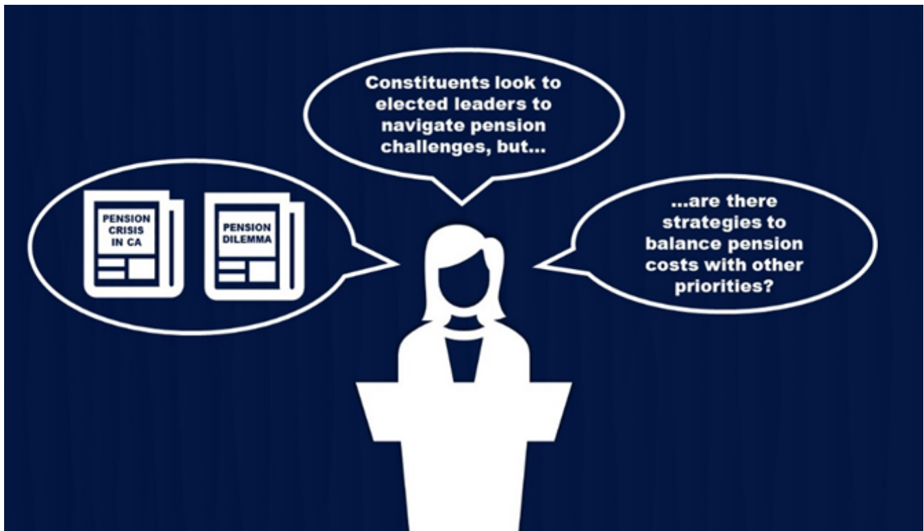
Pension Fundamentals – Part 1, Pension Introduction.

The two-part Pension Fundamentals series is designed to help California's elected officials guide their agencies toward long-term financial sustainability through an understanding of fundamental pension concepts and their role in balancing pension costs with other policy priorities.