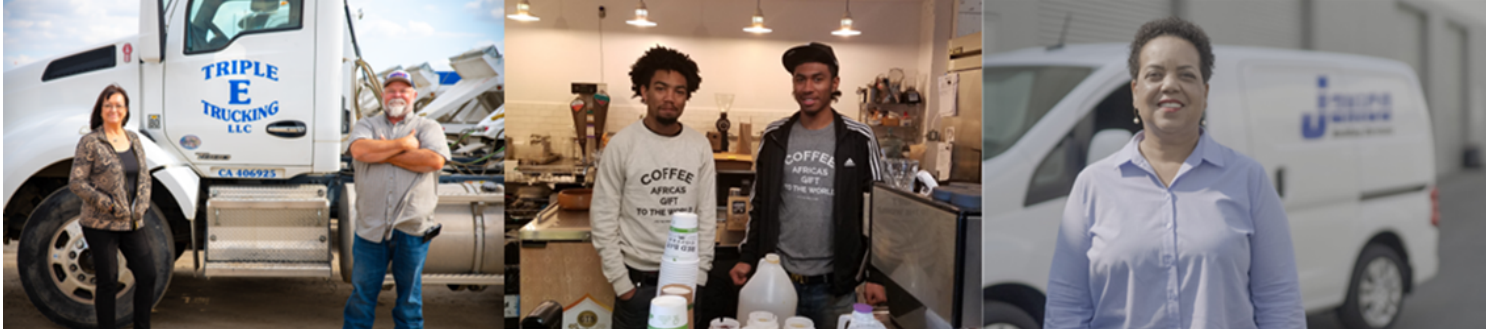
CalSavers participants pictured from left to right: Triple E Trucking, Bakersfield; Red Bay Coffee, Oakland; and Janico Building Services, North Highlands.

CalSavers is already making a difference in helping Californians save for retirement. As of mid-August, more than 317,000 savers have begun saving for retirement, saving an average of $2,000 a year.