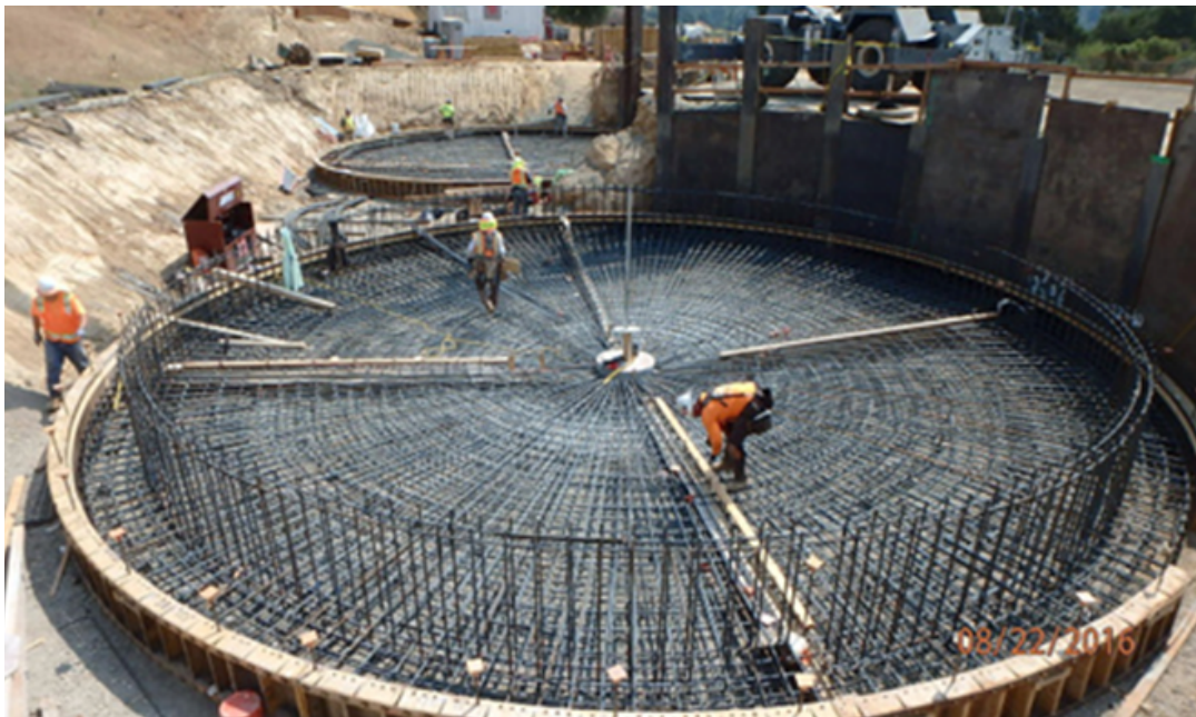
San Jose Water Company project under construction.

CPCFA's water furnishing conduit issuances, such as the 2016 San Jose Water Company tax-exempt private activity notes worth $70,000,000, allow private water providers to prevent the pollution and contamination of drinking water and improve the quality of water. San Jose Water Company made upgrades to its treatment plants, wells, reservoirs, tanks, pump stations and other functionally related structures and equipment throughout their service area in various portions of incorporated and unincorporated Santa Clara County.