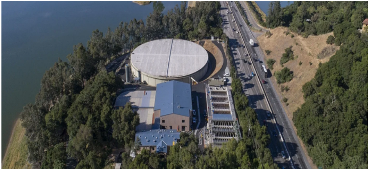
San Jose Water Company completed project.

In addition to the issuance of tax-exempt private activity bonds/notes and taxable bond anticipation notes, CPCFA is tasked with coordinating the review of certain rate reduction bonds to finance and/or refinance certain water, wastewater and electrical utility projects approved by joint powers authorities. Rate reduction issuances are designed to allow California local agencies that own and operate utilities to access financial structures to lower the cost of financing projects, including water projects integral to reliably delivering drinking water to Californians.