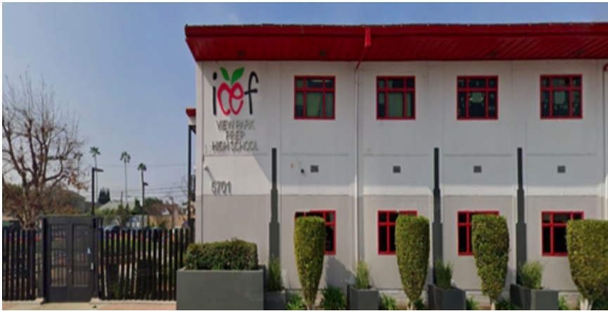
Inner-City Education Foundation (ICEF) View Park Prep High School.

One such example is Inner-City Education Foundation (ICEF), located in South Los Angeles. Three of their schools, View Park Elementary, Middle, & High School, have student bodies of which are about 90% Black on each campus. CSFA has awarded nearly $41 million in program funds to multiple ICEF schools across several programs. According to ICEF, the network is one of the first charter organizations in Los Angeles and has become a leader in California for raising Black and Latinx student achievement and closing the achievement gap. This year, ICEF Vista Middle Academy made the National Schools to Watch list for their positive