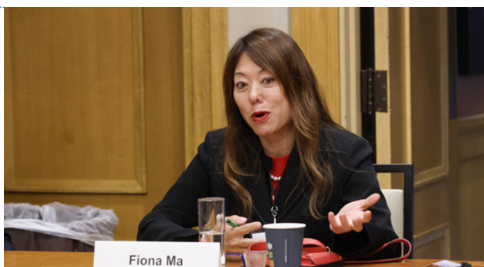
Treasurer Fiona Ma speaking at the Roundtable.